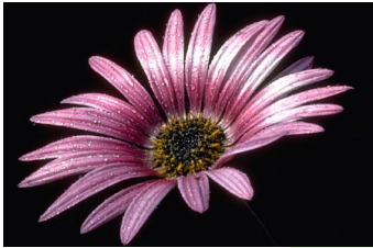
Getting ready for spring landscaping and spring cleaning? Call us for referrals